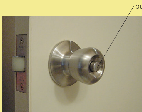
toilet door - interior