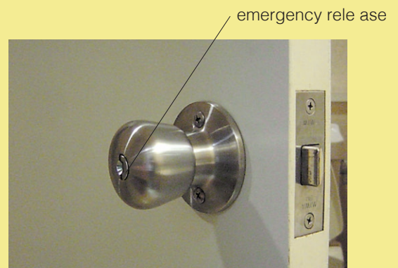
toilet door - exterior