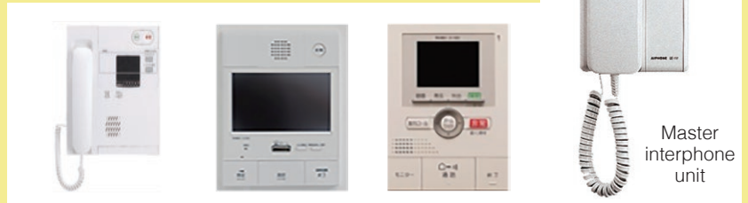
Master interphone unit