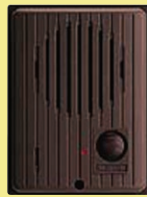
Door interphone unit

* If there is automatic fire alarm or it is connected to common area equipment, a remodeling application cannot be made.